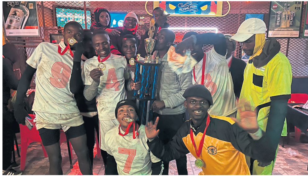
XD United FC from Nqabara Village won the rural development games tournament over the weekend and received a brand-new soccer kit and trophy.

This rural development event was scheduled to accommodate two sporting codes which are